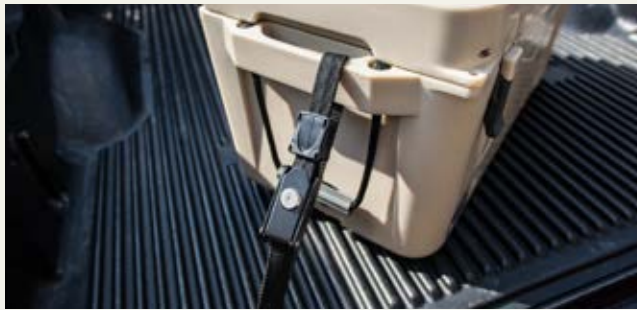
STEELCORE SECURITY STRAP