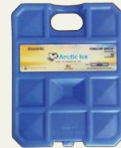
CHILLIN BREW ICEPAKS