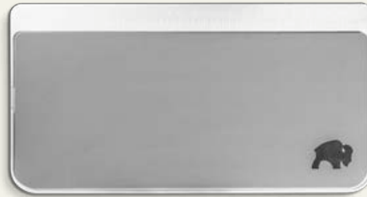
HYDRO-TURF PERFORMANCE TRACTION PAD