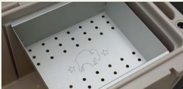
DRY GOODS TRAY